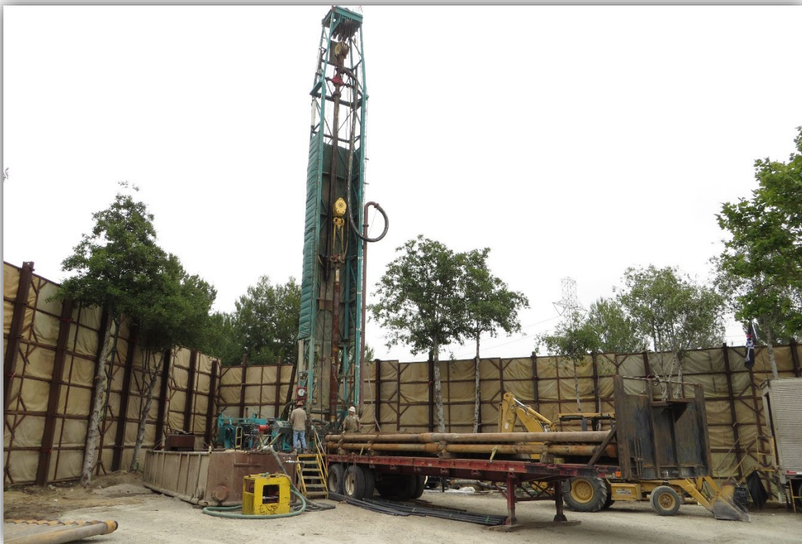
Figure 1: Typical well drilling operation - CVWD Well 48 Drilling May 2016

The replacement well will be located on the same site as the existing well, three storage tanks, and pump station. The site is already fully developed so there will be no impact once construction is complete. Well 49 will provide CVWD customers with a high quality, cost-effective, local water supply for decades to come.