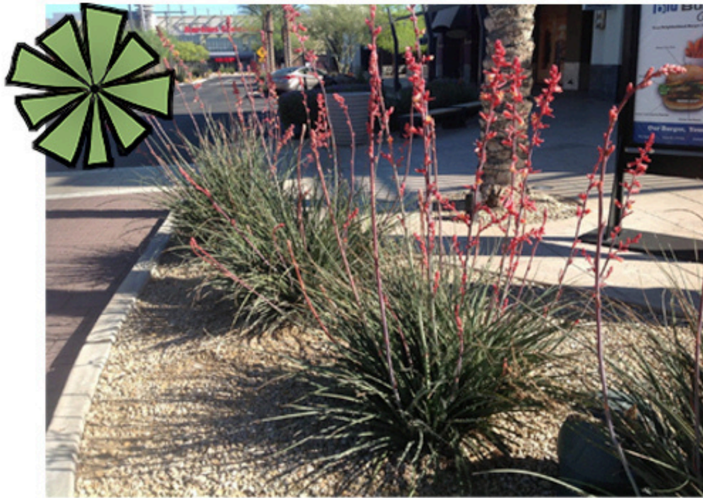
Red Yucca, Hesperaloe parvifolia 2' h x 3' w Note: not a true yucca. spineless.

Example parkway dimensions are 4.5' x 40'