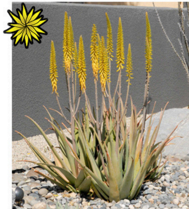
Aloe vera, Aloe vera 2' h x 2' w