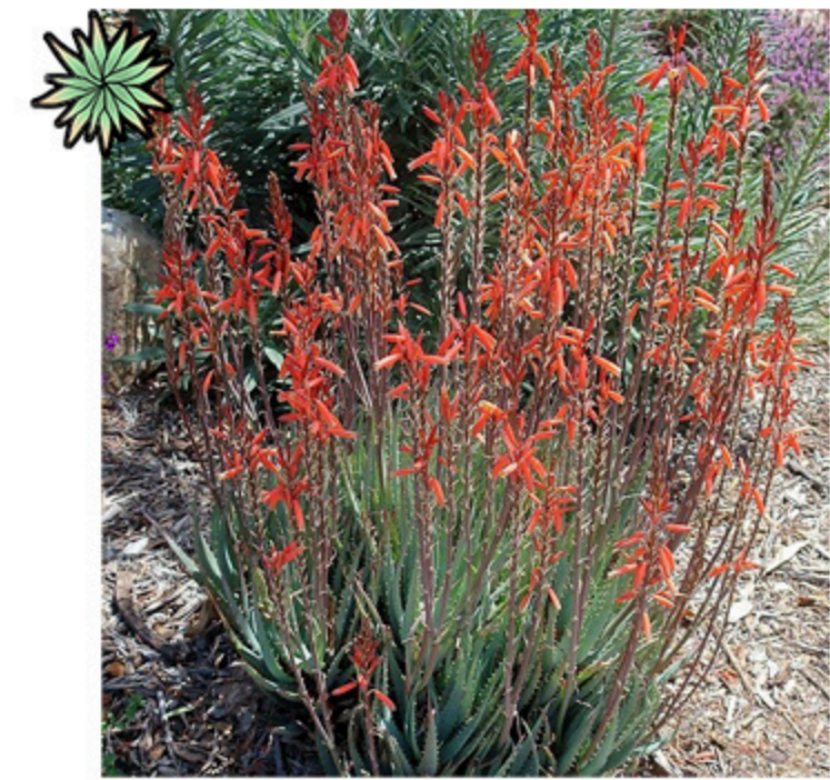
Blue Elf Aloe, Aloe 'Blue Elf' 0.5' h x 1.5' w